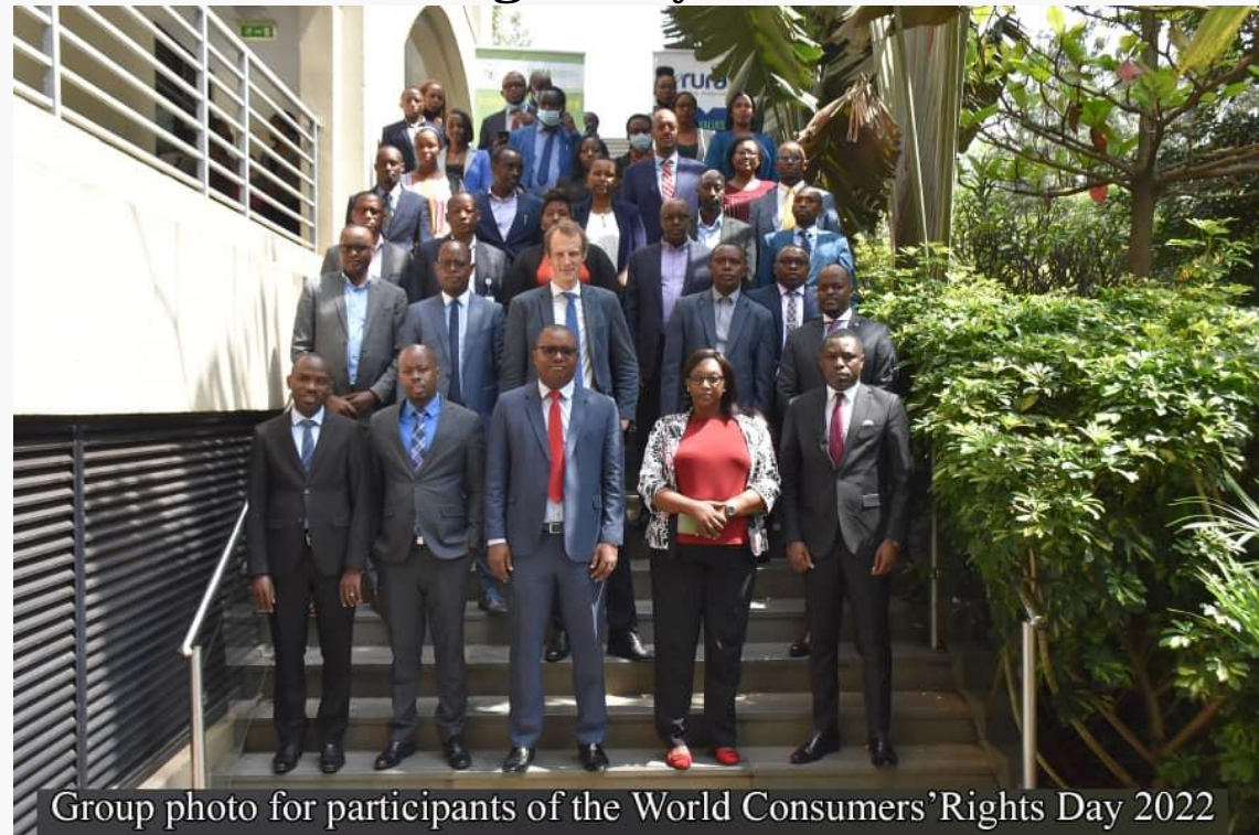
Group photo for participants of the World Consumers' Rights Day 2022

Every year March 15 is celebrated as World Consumer Rights Day. The day is meant to highlight the importance of the consumer and the rights that protect them in a market society. Rwanda being a developing country has organized a week from 7th March to communicate and educate consumers about their rights the, theme of this year 2022 was "FAIR Digital Finance". AMIR has participated together with different stakeholders like BNR, ADECOR, RURA, and MINICOM. RICA has been the leading institution in the organization of this campaign and celebration, the day has been celebrated in Marriot Hotel-Kigali Rwanda, different consumers representatives have been invited to discuss issues related to digital finance.